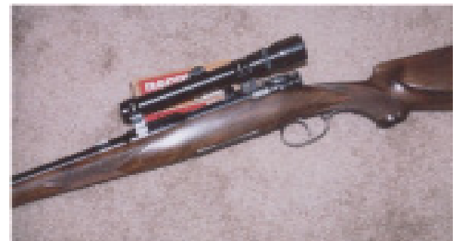
Model NO with Steyr proprietary scope mount see page 5