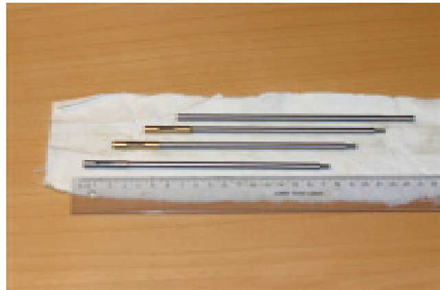
The Sparholt cleaning rod set