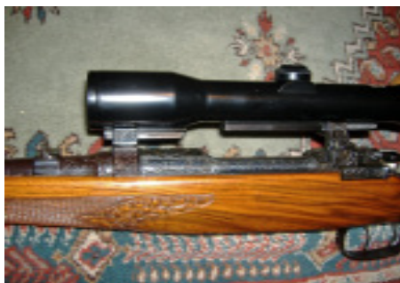
Premier + Steyr Mounts

On finally collecting the MCA from the store I had a real surprise waiting for me. Oh my goodness! A genuine original front sight hood was still on the front ramp! That discovery made the two and a half hour drive to pick it up well worth the effort! As to the other features of the rifle, it is not in as poor a shape as I expected by any means, a 1965 product, and easily rating 90% condition. The only surfaces really in need of care are the bolt and trigger, so I can get to work with the superfine steel wool and Happich Simichrome polish. Sometimes you just happen to encounter a good thing.